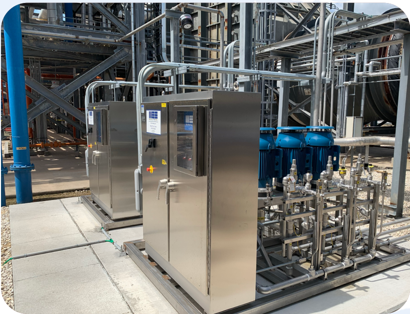
The MeeFog pump skid provides high pressure water to fog manifolds located at turbine inlet.

MeeFog Systems have been approved by every major gas turbine manufacturer in the world.