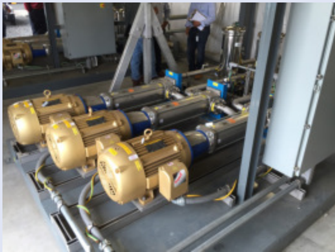
Pumps run at low speed for long life.