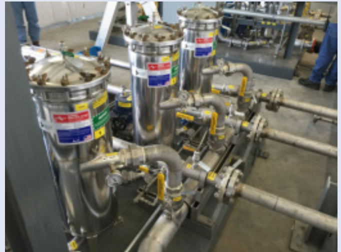
Self-contained MeeFog pump skids are pre-engineered and can be quickly modified for specific applications.