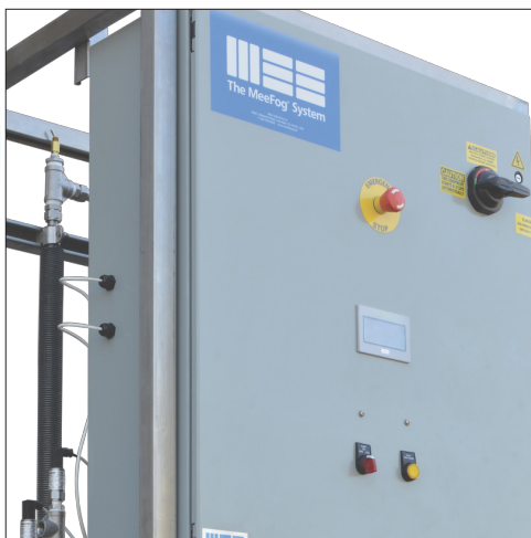
Control panel includes a PLC with user interface screen and allows BACnet communication with building automation.